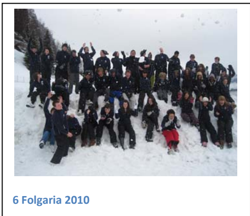
6 Folgaria 2010