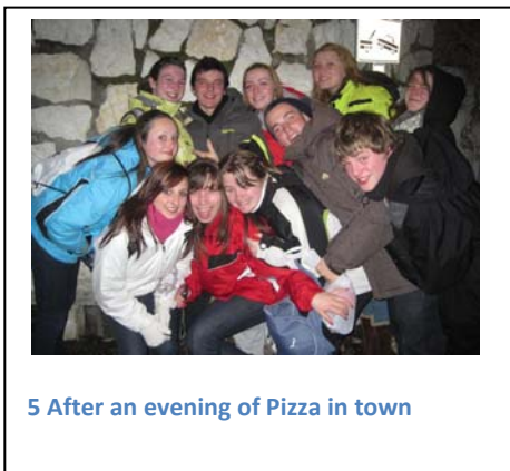
5 After an evening of Pizza in town