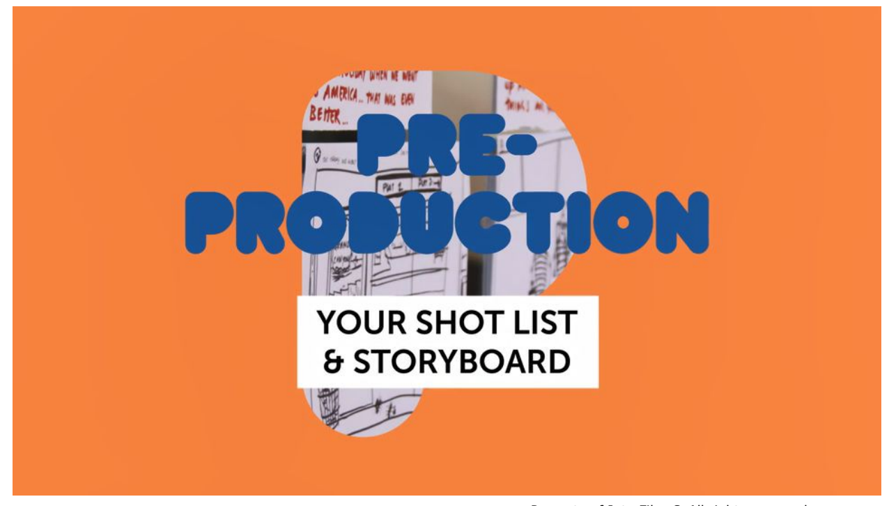
Property of Into Film © All rights reserved

Storyboards help you plan on paper how your entire film will look and prepare you for your shooting days and the final edit. Even if your drawing skills are not very good (stick people or even photos are fine), having a storyboard can help visually explain your idea to your crew.