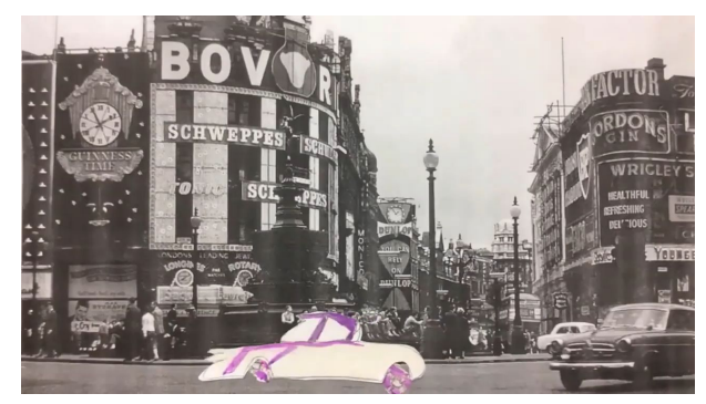
Property of Into Film © (2018) All rights reserved