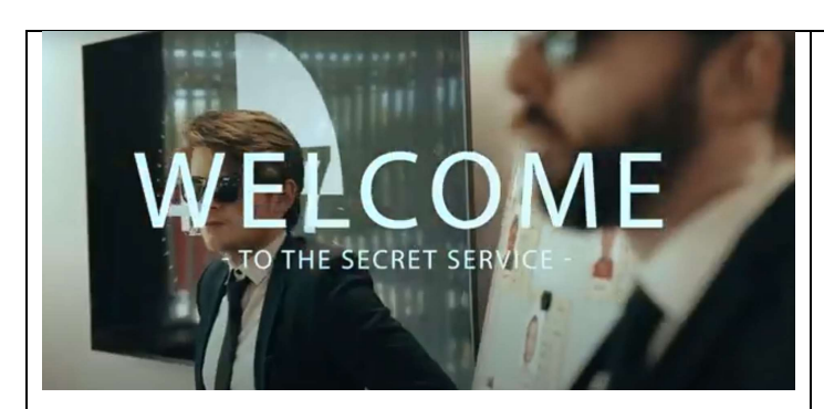
15% off voucher for Escape Live Coventry for all participants